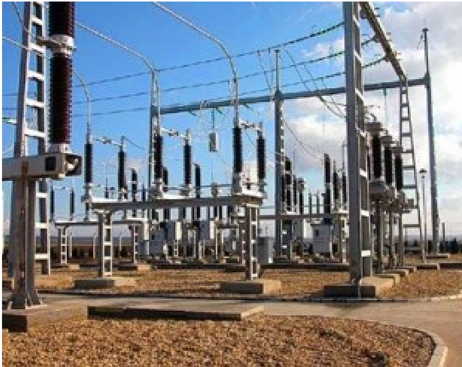
Fig. 3. Example of an image as it will appear at the electronic version of the Journal and a multi-line caption