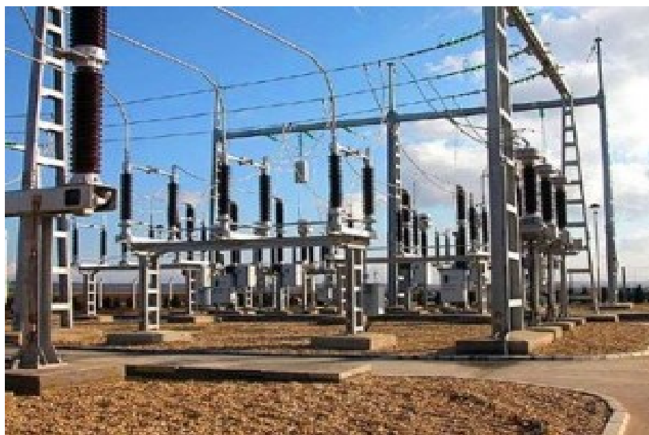
Fig. 3. Example of an image as it will appear at the electronic version of the Journal and a multi-line caption