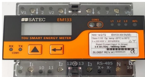
Fig. 1. Appearance of EM133-XM (SE)-5A

Appearance of EM133-XM(SE)-5A is shown on Figure 1.