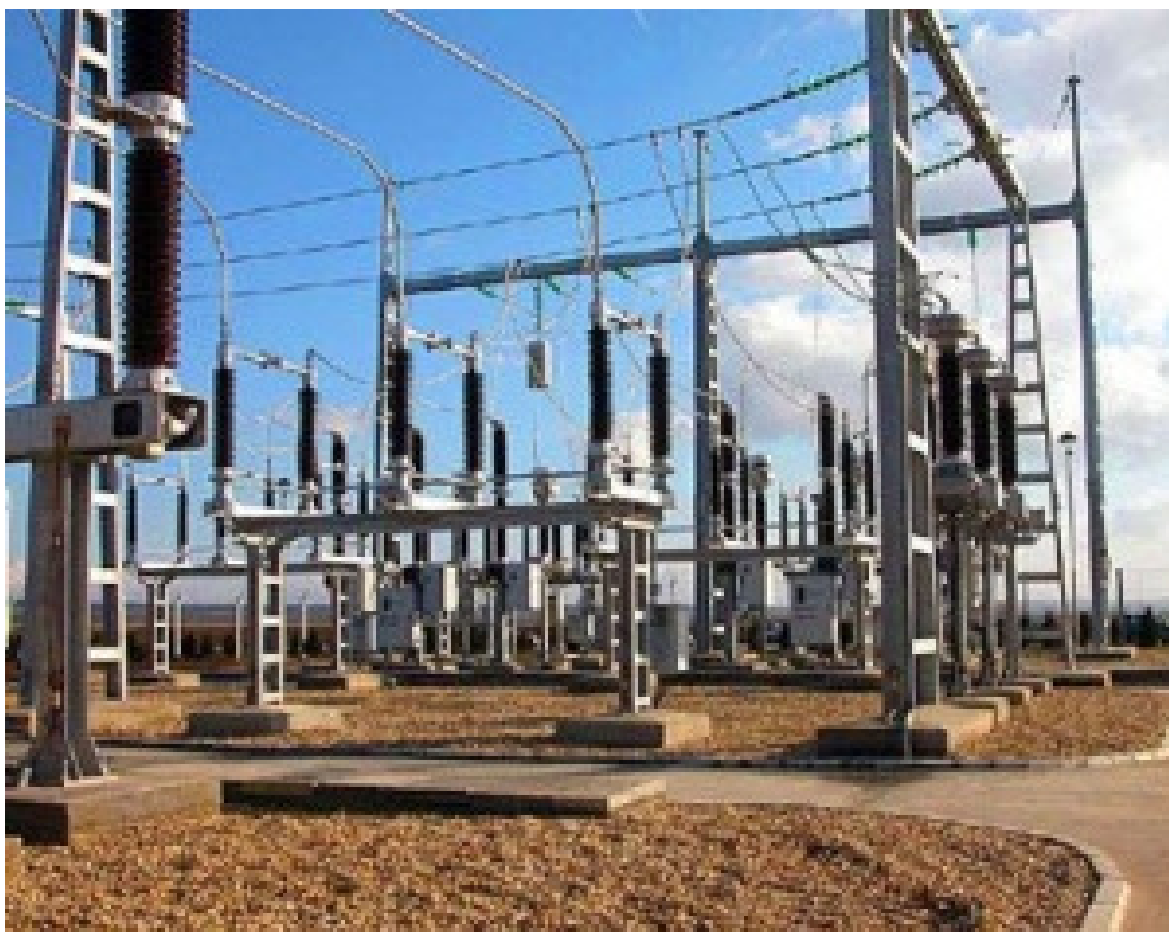
Fig. 3 Example of an image as it will appear at the electronic version of the journal and a multi-line caption