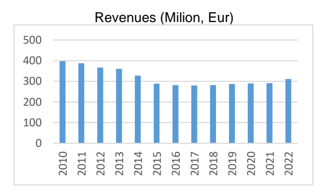
Fig. 1. Total annual revenues in the Macedonian market of electronic communications in the period 2010–2022

The annual report for 2023 is expected to be published by the Agency for Electronic Communications in October 2024.